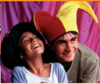
Staff Student Show