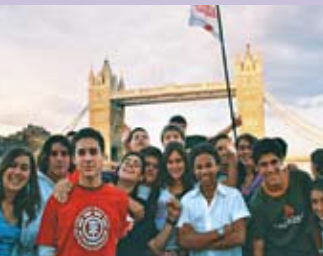
Trips & Visits